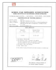
Infrared Ray Test